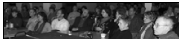
Audience at the Coffeehouse