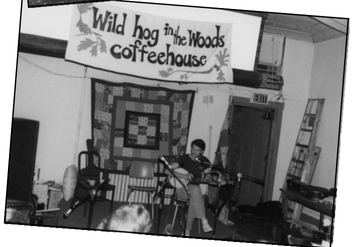
Top two photos: Jamming and planning the future Wild Hog Remaining four photos: At the Wild Hog, 604 University Avenue, circa 1978/9